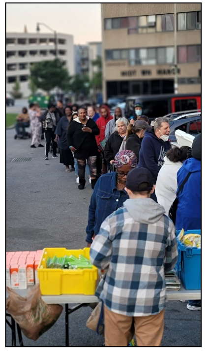
A long line for groceries at Southeast Towers II and The Savannah.