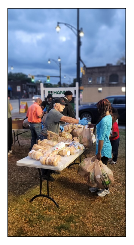
The bread table on Chili Avenue.

GOD SPOKE through a child in the city. I will never forget her.