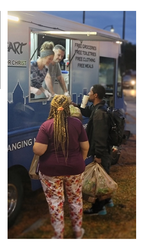
Hot food on Chili Avenue.

For newly purchased items, please consider making the purchase through Amazon Wishlist. See the Amazon Wishlist box on Page 5. Or, donations can be dropped off at The Father's Heart headquarters, 678 Lake Avenue, Wednesday from 8 a.m. to 12 noon, and Thursday and Friday from 9 a.m. to 5 p.m. For information, call (585) 472-4331.