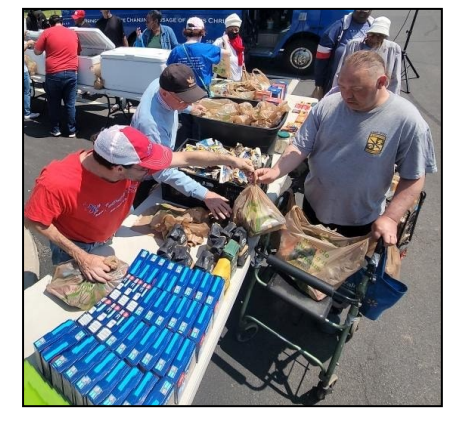
Bread at Lyell and Sherman.

1 CORINTHIANS 9:24-25: "Do you not know that those who run in a race all run, but one receives the prize? Run in such a way that you may obtain it. And everyone who competes for the prize is temperate in all things. Now they do it to obtain a perishable crown, but we for an imperishable crown."