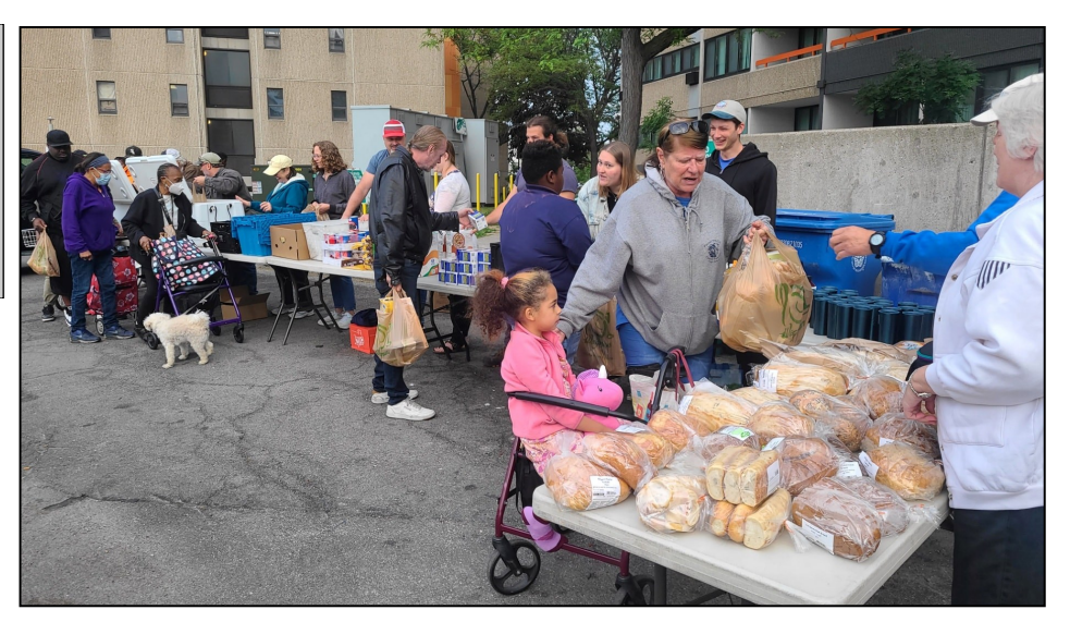
The groceries line at Southeast Towers II and The Savannah.

Clothing: Women's Capri leggings and new women's underwear; men's summer clothing. General: Small body lotions. Donations can be dropped off at The Father's Heart headquarters, 678 Lake Avenue, Wednesday from 8 a.m. to 12 noon, and Thursday and Friday from 9 a.m. to 5 p.m. For information, call (585) 472-4331.