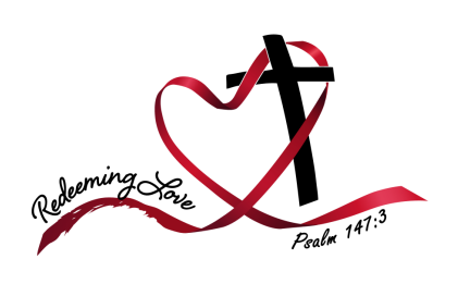
Redeeming Love is a branch of The Father's Heart ministry that focuses on addicted and/or exploited women on the streets of Rochester.