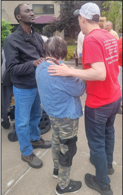
Servants pray with a woman at Pinnacle Place apartments.