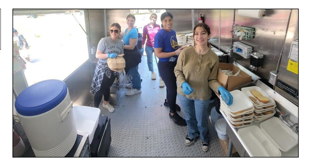
Volunteers package and serve hot meals on Thurston Road.

THE LORD is showing how faithful He is to us. I was questioning if the ministry was effective, and the enemy was putting doubt in my mind